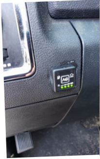
Gas to Propane switch on console