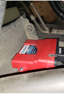
Computer Control Module