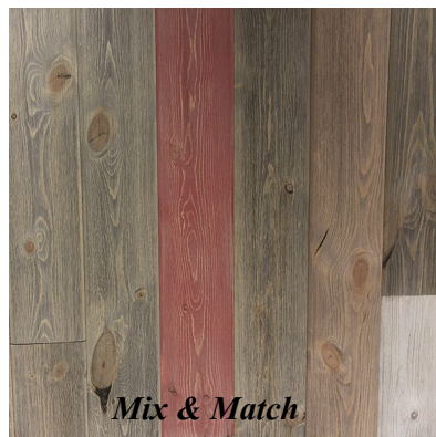
Mix & Match