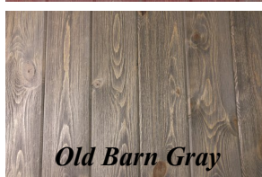
Old Barn Gray