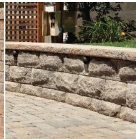
SUPREMA sculpted SAVE 1.50$/sq. ft.