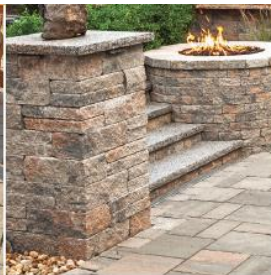
PILLAR 24" MINI-CRETA 6" SAVE 1.00$/unit