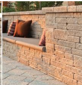
MINI-CRETA 3" & 6" SAVE 1.00$/sq. ft.