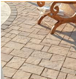
MISTA random SAVE 30¢/sq. ft.

Techo-Bloc is bringing back their Contractor Rebate Program . From March 1 to July 30, 2016, get an instant rebate on the following products.