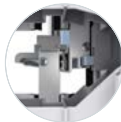
Dual sashes with weatherstripping and interlocking rail create a tight seal