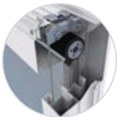
Quad pulley balance system for smooth and reliable operation