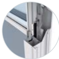
Stainless steel aircraft cable supports the counterbalanced sashes for easy ventilation