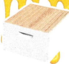
Deep Hive Box with Frames