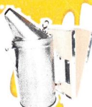
Bee Smoker Engine with Guard