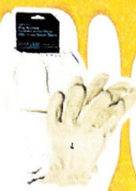
Heavy Duty Vented Gloves