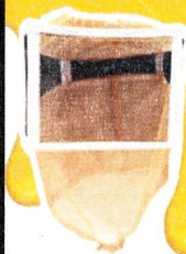
Folding Bee Veil

Let Powell Feed & Milling help you with ALL of your BEE needs!