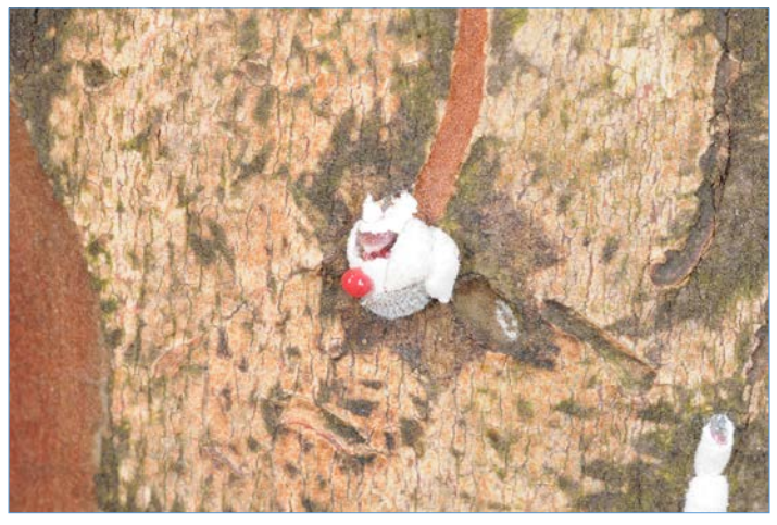
Use a toothpick or knife point to break the felt-like covering and the insects will bleed pink, or you may see a cluster of pink eggs.

Sooty mold alone is not a definite indication of CMBS, but if you also find white, felt-covered scales that bleed pink when punctured, you can be sure you have found crape myrtle bark scale. Heavy infestations of crape myrtle aphids can also cause trees to be covered with black sooty mold, but any crape myrtle that is covered with sooty mold should be carefully examined for CMBS. Sometimes trees have heavy infestations of aphids and CMBS. Aphids will only feed on the leaves; CMBS will feed mainly on the twigs, branches, and trunk, and rarely on the leaves.