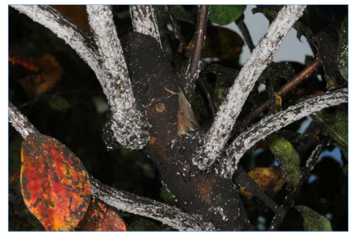
Look for crape myrtles with heavy accumulations of black sooty mold on the leaves, limbs, and trunk.

Heavy infestations of crape myrtle bark scale are easy to spot and identify: