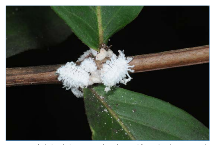
Hyperaspis lady beetle larvae are also white and fuzzy, but they are good predators of crape myrtle bark scale.

As is often the case with new, nonnative insect pests, CMBS has few natural enemies here in the U.S., and this is why they are able to reach such high, damaging populations. There are several species of lady beetles, including the nonnative, multicolored Asian lady beetle, the twice stabbed lady beetle, and the Hyperaspis lady beetle, that feed on CMBS, and large numbers of lady beetles can usually be found on heavily infested trees. But lady beetle population growth tends to lag behind that of the bark scale, and lady beetle predation may not be adequate to prevent development of heavy CMBS infestations and heavy accumulations of sooty mold.