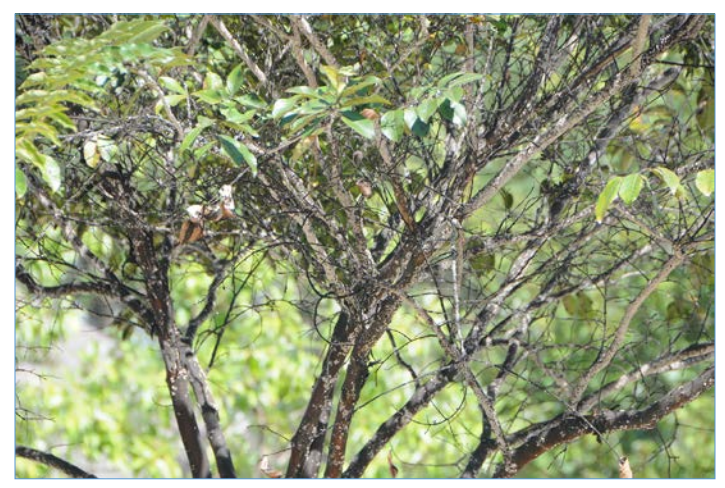
Although they also occur on the trunk and lower limbs, many CMBS will be on smaller branches and twigs higher in the tree.