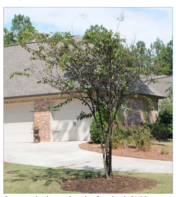
Crape myrtles that are heavily infested with CMBS are covered with sooty mold and bloom poorly. Note that the mulch underneath this tree is also black with sooty mold.

eydew, and this results in heavy accumulations of sooty mold on the leaves, twigs, and trunks of infested plants, as well as on nearby low-growing plants and surrounding grass and mulch. The end result is a crape myrtle that is black and ugly (due to heavy sooty mold accumulation) and produces fewer and smaller blooms. Unless they are treated, crape myrtles that are heavily infested with CMBS become a landscape eyesore. Effective treatments are available, but they are relatively costly and do not provide 100 percent control, meaning that treatments must be reapplied each year.