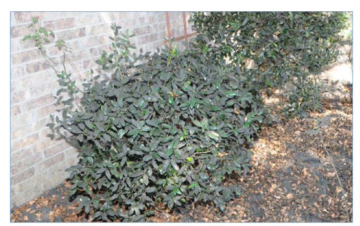
Even mulch and plants growing beneath crape myrtles heavily infested with crape myrtle bark scale will be covered with sooty mold.

There are few natural enemies here in the U.S., and this allows CMBS to build to unusually high numbers on infested plants. It is not unusual for heavily infested plants to have branches and twigs that are completely encrusted with scale. The nymphs produce large quantities of hon-