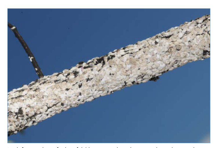
Look for patches of white felt-like material on the twigs, branches, and trunk. Heavily infested twigs may be completely encrusted with scale.