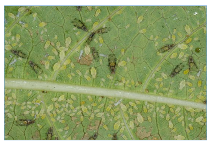
Heavy infestations of crape myrtle aphids will also cause trees to be black with heavy accumulations of sooty mold.

Although CMBS is easy to detect and identify on heavily infested plants, low infestations on recently infested plants are hard to spot. Inspect plants especially carefully before purchasing. Don't just look at the trunk and lower limbs when checking large trees in the landscape. Be aware that most of the scale will be on small twigs and branches in the upper part of the tree, and check these areas as well.