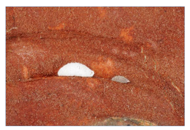
Adult female scales are covered with a soft, off-white felt-like material and are about one-tenth of an inch long. The nymphs (right side) do not have this covering.