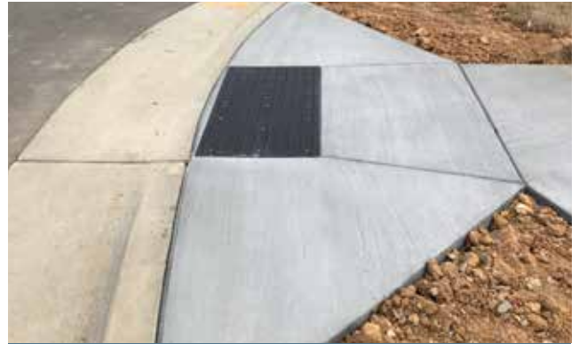
Ideal for DOT, commercial & residential