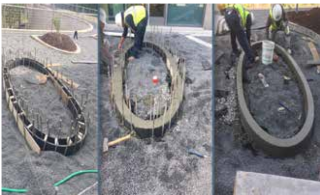
Use as a form