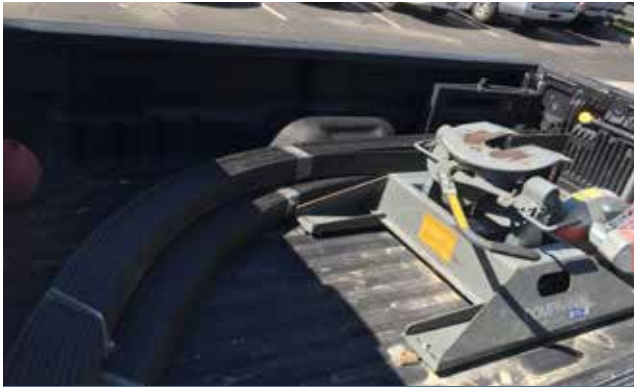
Bends to fit inside truck bed

Polypropylene Joint Filler Plank and Sheet