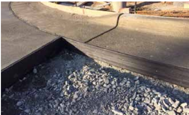
Easily bends to curves